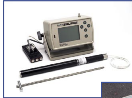
Eclipse® Receiver (right) and Cable System (above), showing, from top, Cable-Ready Remote Display with Power Supply, Cable Transmitter, and Extraction/Insertion Tool