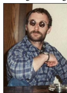
Who dares wins!